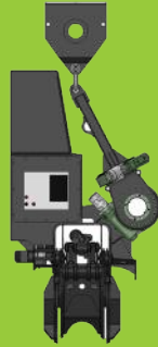
Vertical Working Position