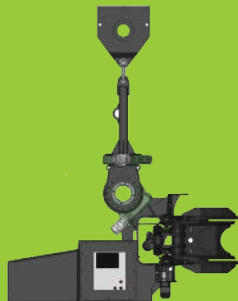
Horizontal Working Position